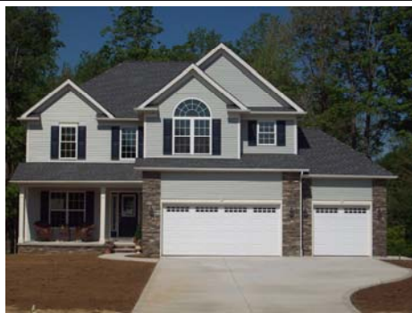
2442 Greenbriar Lane Madison Township (Whispering Pines Subdivision) $279,900