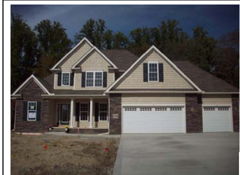
12381 Summerwood Drive Concord Township (Summerwood Subdivision) $324,900

Purchase a home at $324,900 and pay only $3.00 more on your monthly mortgage payment than a $279,900 home purchased at the 5.25% 30 year fixed rate!